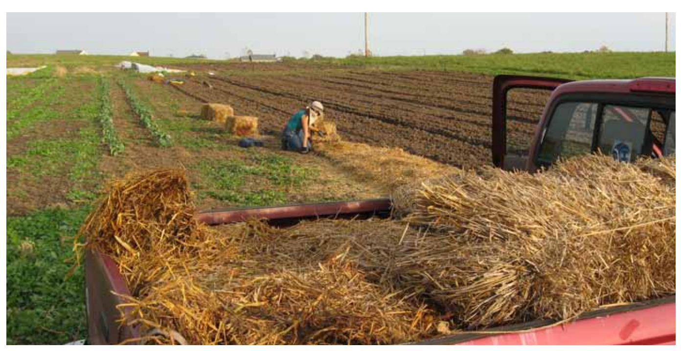
Radical Root Farm

Marketing ventures may also provide resources that are not otherwise available. Many cooperative models provide technical outreach services to their members.