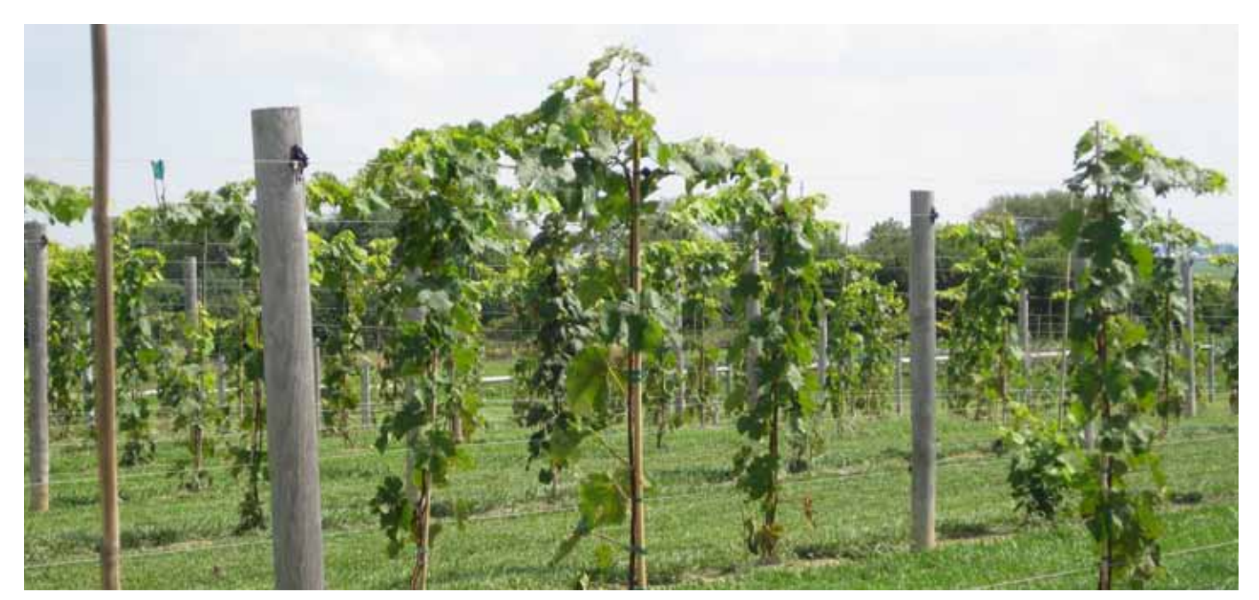
Salute! Farm and Vineyard